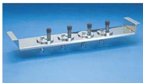
Top of water tank for BK/BA610,710