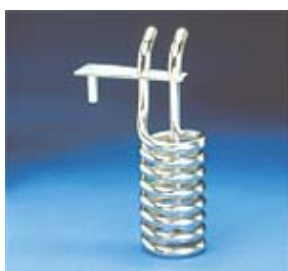
Top of water tank for BK/BA300,400,500