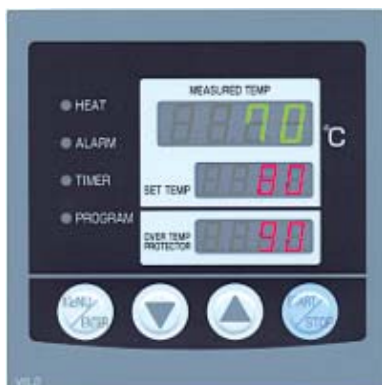
for BA type