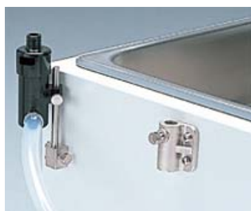
Easy to change Water Level by adjusting Over Flow