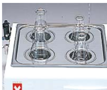
Useable for various containers