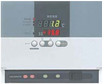
Flow amount monitor, Compressor monitor, Compressor operation