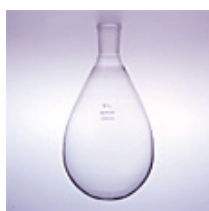
Evaporating flask of 1L