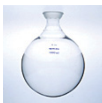
Receiving flask of 1L