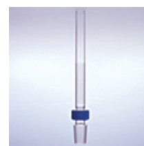
Rotary joint (for A, B & C type)