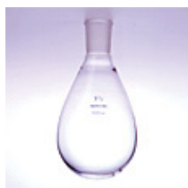
Evaporating flask 2000ml, 500ml, 300ml, 200ml, 100ml (TS 29/42 opaque & frosted)