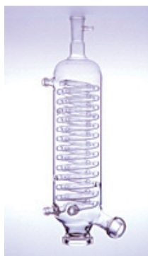
Condenser for A-type