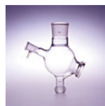
Condenser connector (for B and C type)