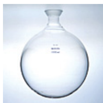
Receiving flask 2000ml, 500ml, 300ml, (S35/20)