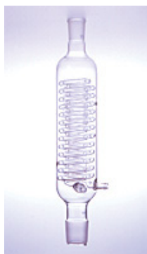
Condenser for B-type