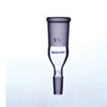
Joint TS 29/42 to TS 29/38, TS 29/42 to TS 24/40, TS 29/42 to TS 19/38, TS 29/42 to TS 15/25, TS 24/40 to TS 24/40, (opaque & frosted)