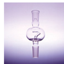
Trap ball TS 29/42 to TS 29/42, TS 24/40 to TS 29/42, TS 24/40 to TS 29/42, (opaque & frosted)