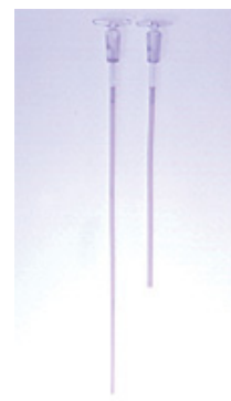
Sample feed tube (for B & C type)