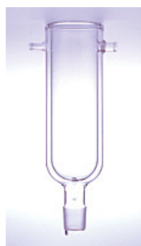
Condenser for C-type