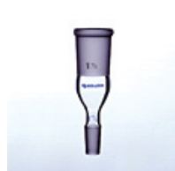
Joint TS 29/42 to TS 29/38, TS 29/42 to TS 24/40, TS 29/42 to TS 19/38, TS 29/42 to TS 15/25, TS 24/40 to TS 24/40, (opaque & frosted)