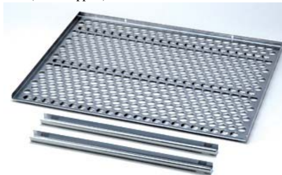
Stainless Punching Metal (Weight Tolerance 15kg/pc)