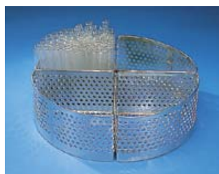
Test Tube Rack