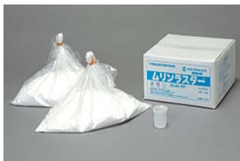
Amorphous Phosphorus Detergent