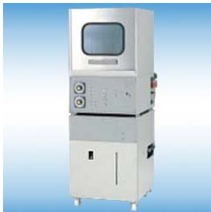
AW62+Pure Water Supplier