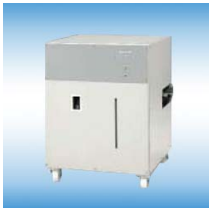
Pure Water Supplier