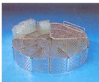
Test Tube Rack