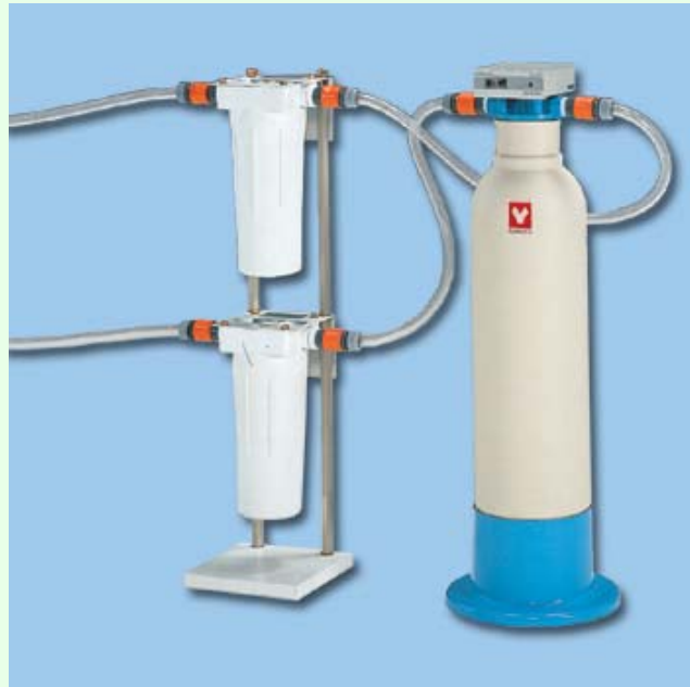
This sets is WL100+Filter Stand (1)+Filter Housing Unit (2)+Active Carbon Filter+Membrane