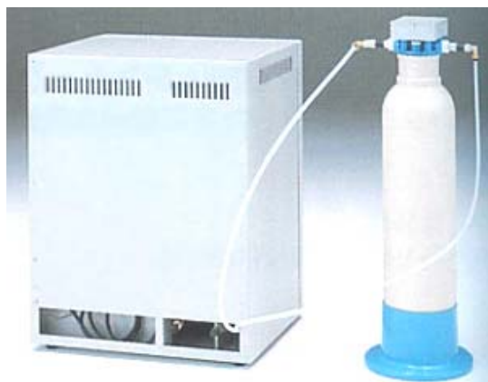
Connection Unit G (WL100+WG250)